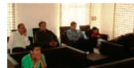
Residents watching the India v/s England Cricket Match in the TV Lounge with their young guests