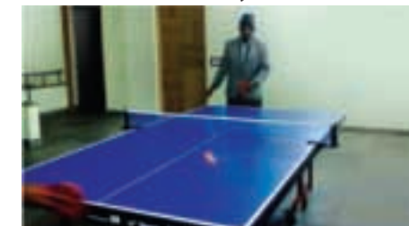
A game of Table Tennis is a great way to pass the time