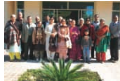
Utsav residents and guests in front of the Activity Centre on New Year's Day

About 350 guests, comprising customers, staff and other friends of Ashiana, enjoyed a multi-faceted show to celebrate the New Year. There was fusion music, interactive games, folk dances, semi-classical music and a festival of kites. The appreciation and participation of the guests made the day a success.