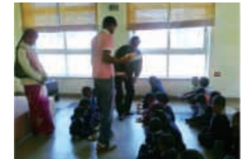
Snacks being distributed to the children of Ashiana Phoolwari School on Republic Day