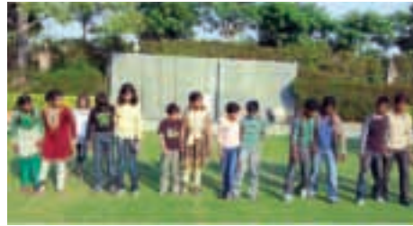
In line for the 3- Legged Race

About 400 excited adults and kids (Ashianaites from Delhi, Jaipur and Bhiwadi, along with their families) congregated at Bhiwadi in February for our annual affair: the Ashiana Family Meet.