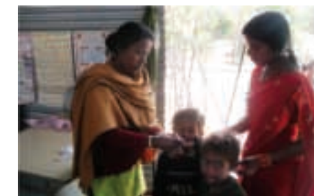
Pulse Polio Drives are undertaken regularly at all our sites, along with basic information on health and hygiene