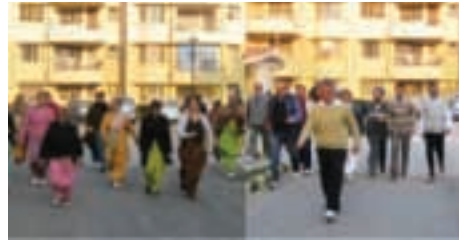
"I have two doctors, my left leg and my right", said a wise man, and our residents follow that too!

January was the perfect time to organize a Walking Competition. A cup of tea was ready to refresh the walkers after they completed the round.