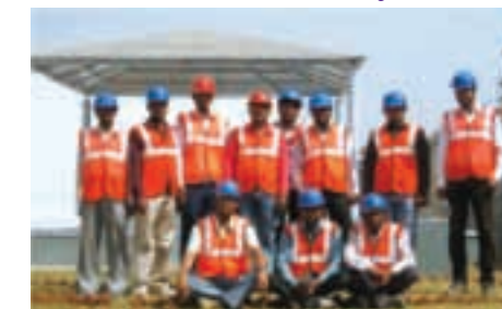
Supervisors of Rangoli Gardens in their new Night Vision Uniforms