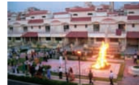
Holi Celebrations at Utsav