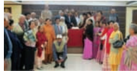
Cutting the cake on Valentine's Day