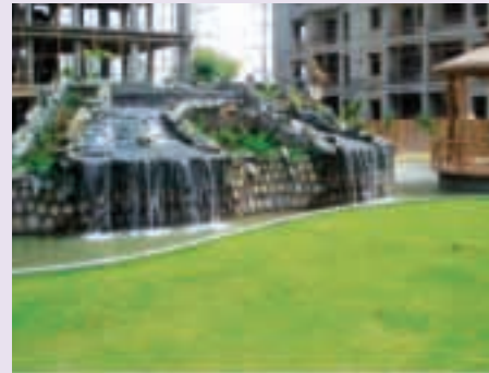
Utsav Jaipur's Park is perfect for a walk with its soothing sound of water and calming look of greenery