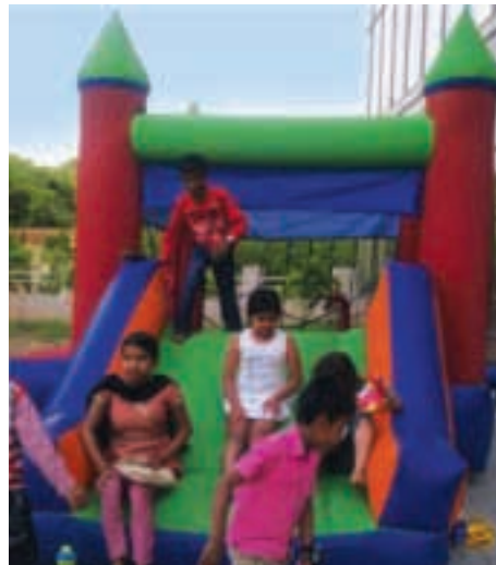
The Bouncer at the Village Centre keeps the kids entertained

As we say, we're all ears to feedback from our valuable customers, and the setting up of a Kid's Zone in the Village Centre is another example of it.