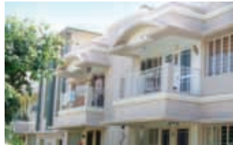
Newly re-painted Ashiana Gardens looks pretty as a picture