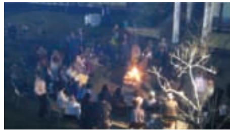
Utsav Residents around the bonfire at the Treehouse