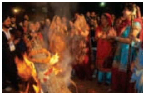
Residents present a charming picture as they celebrate Lohri

Ashiana Gardens residents celebrated Lohri with full zeal, doing the bhangra, the gidda and singing folk songs around the bonfire. Til, gajak, peanuts and popcorn were offered to the 'fire' and shared between residents in a beautiful display of conviviality.