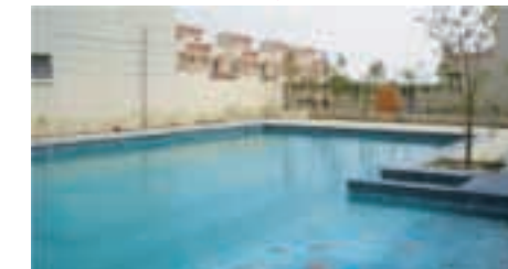
The Swimming Pool at Ashiana Manglam is the perfect spot for summer