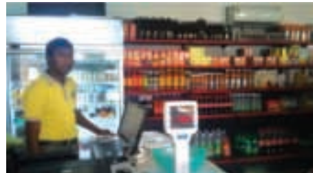
'1947 Retail', at Ashiana Aangan is well stocked

Adding to the convenience factor for our residents is the retail store '1947 Retail' at Ashiana Aangan. It offers a great shopping experience thanks to the wide variety of general merchandise, home ware, stationary, food, vegetables and grocery.