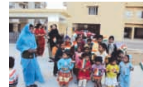
The children at our Greenwood Site Phoolwari School get ready to sing and celebrate Republic Day