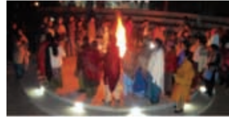
Utsav Residents celebrated Lohri at the Amphitheatre and danced to the beats of the dhol