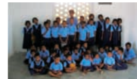
The number of children being enrolled at Ashiana's Phoolwari Schools is going up.