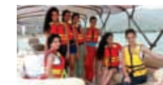
Femina Miss India winners enjoying water sports at Lavasa

Lavasa is also coming up as an excellent educational hub, and the latest major player in this field is Le Mont International School which offers international curricula at primary, middle and high school levels culminating in the International Baccalaureate Diploma.