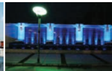
A stunning night time view of another water body