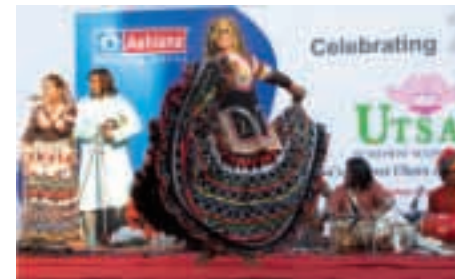
The Kaalbeliya Dance performance at the New Year Event