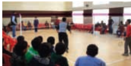
The Badminton Tournament in progress at Aangan's Club House

Enthusiastically played and eagerly watched, the Inter-Ashiana Badminton Tournament was held at the Aangan Club House on January 14, 15 and 16.