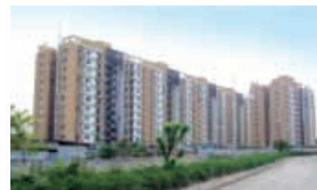
A view of Ashiana Greenwood, Jaipur