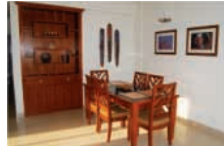
The Dining Room of the Sample Flat at Rangoli Gardens