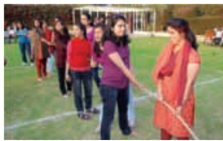
The Delhi Team gets ready for Tug-of-War