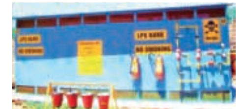
Like everything else at our projects, the Gas Bank at Amarbagh is an example of safety, meticulousness and aesthetics