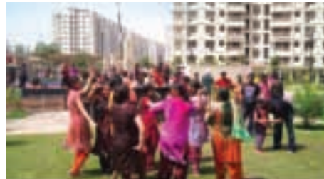
The Central Park at Ashiana Aangan was the perfect venue for Holi