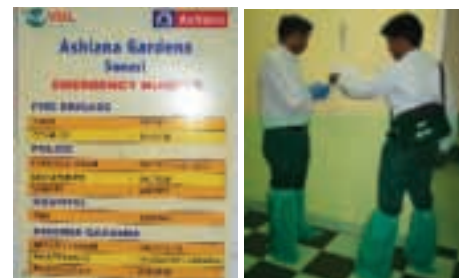
Three new boards showing Emergency numbers have been put up for the convenience of residents. VML has introduced Tool bags for the tradesmen and hand and shoe gloves for the electricians