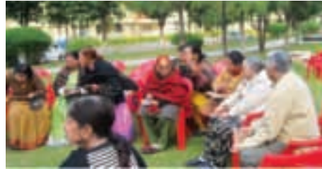
Utsav Residents soak the sun as they play Tambola in Utsav's Park 1 in January