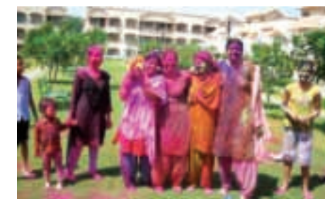
Ladies of Ashiana Greenhill playing holi in the park

Colours, pakoras and thandai were laid out for the residents on Holi to enjoy themselves to the fullest. A dhol played in the background.