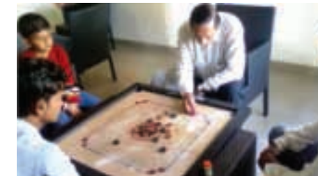
Concentrating on a game of Carrom at the Activity Centre