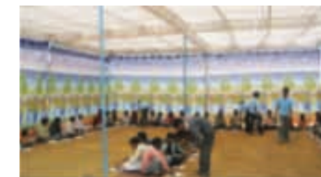
Labourers working at the Rangoli Gardens site enjoy a special lunch during the Republic Day Celebrations