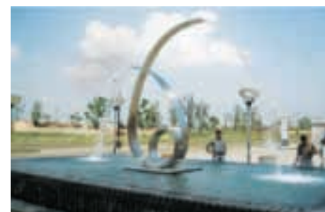
A piece of art that cools the atmosphere