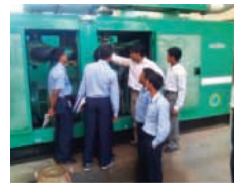
The VML team learns about preventive maintenance of Gensets at Ashiana Aangan.

A training session on Leadership and Team Building was organized by VML for Estate Managers and Estate officers. A session on Safety & Preventive Maintenance was held for the Maintenance Staff. A Basic Masonry training session was also conducted at Bhiwadi with participants from all our centres. The successful candidates were issued CII certificates.