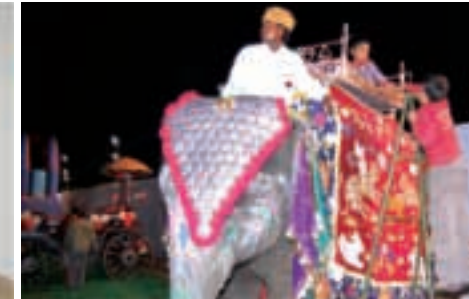
Kids ready to take the Elephant Ride, and (at the back) a buggy decorated with balloons