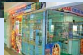
Suhag Churi Palace