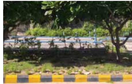
Trees and flowers have been planted in the STP area in Ashiana Village, adding to the beauty of the place