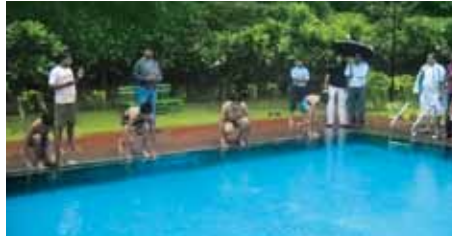
Getting Ready to jump in!