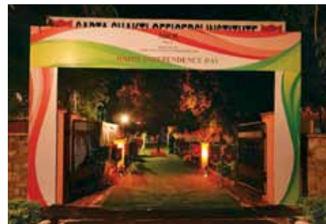
Celebrating Independence Day at Chinkara Officers' Institute