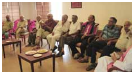
The very first Gents Coffee Evening was an enjoyable affair with an exchange of travel experiences over snacks and coffee!