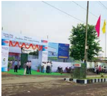
The Entrance to the Marine Plaza Site, decorated for the Foundation Stone Laying Ceremony