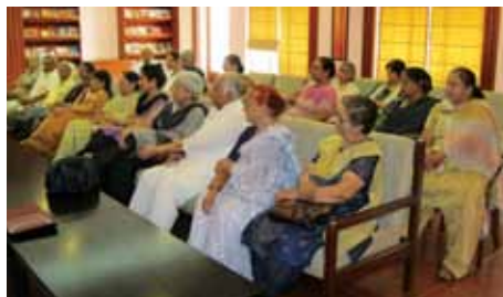
Utsav residents at the Love of Art session at the Utsav TV Lounge.

A new activity called 'Love of Art' has been started at Utsav. It aims to give a platform to our residents to share their artistic talent and knowledge with other residents.