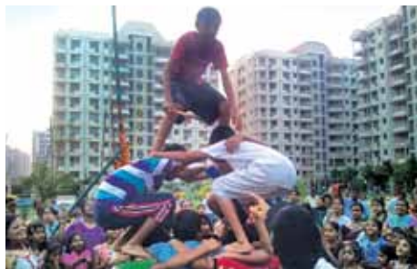
Making it to the top in the Dahi Handi Event

Ashiana Aangan residents celebrated Krishna Janamashtami at the Club House with a night long Jaagran. On the eve of Janamashtami, a Dahi Handi competition was held at the Central Park-1