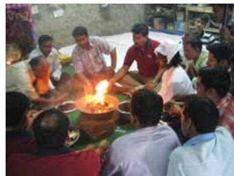
Employees participating in the Vishwakarma Pooja Havan at Rangoli Gardens.

On Vishwakarma Pooja day, Narayana Hrudayalaya Clinic had organized a health check-up camp at Rangoli Gardens for staff members of Ashiana Jaipur. It was followed by a brunch.