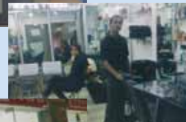
Radhika Unisex Beauty Saloon