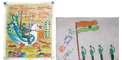
Drawings made by Manglam (Jodhpur) Children on Independence Day