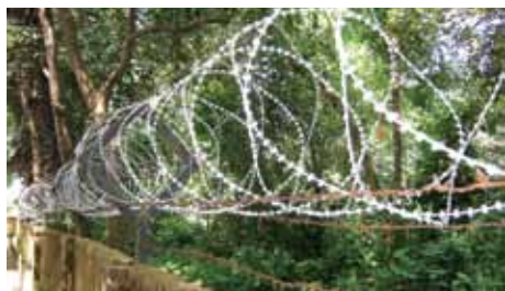
The Concertina Wire Fencing at Ashiana Residency Greens

VML, in its pursuit of better and efficient services and security, has provided its staff with Walky-Talkies at Ashiana Gardens.