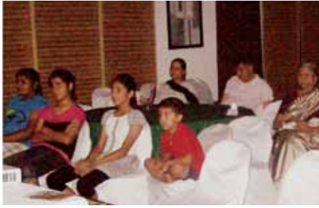
Rapt attention while watching a movie on the big screen at the Treehouse Club

The 2nd Friday of every month is Movie Show Evening, where the latest movies are shown on the big screen.