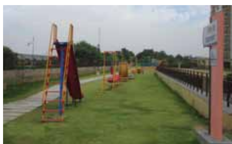
The children's play area at Greenwood

Ashiana Greenwood, with its facilities of gas pipeline connection, automatic power backup, basement parking and kids play area is becoming the most sought after address in town. It is now home to 61 happy families of Govt. officials and private sector executives.