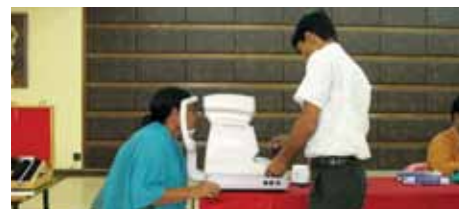
A Free Eye and Dental Check up camp was held at Utsav