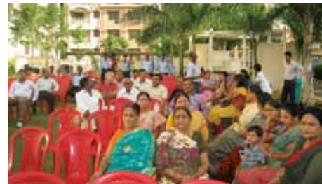
The 'Know Your Neighbour' programme at Ashiana Woodlands was well attended

With occupancy at Ashiana Woodlands increasing, we felt it would be a good idea to organise a 'Know Your Neighbours' function, along with a Tree Plantation drive. It was good to see residents getting to know one another.