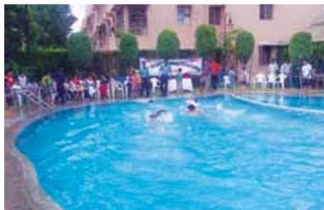
Men's Free- style Swimming Competition in action

Ashiana Gulmohar Park was the venue for the eagerly awaited Inter-Ashiana Swimming Competition. Residents from Aangan, Gulmohar Park, Gardens and the Village Projects took part in it.