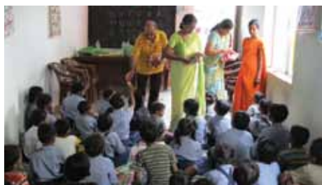
Our Residents visited Phoolwari, told the children stories and distributed sweets