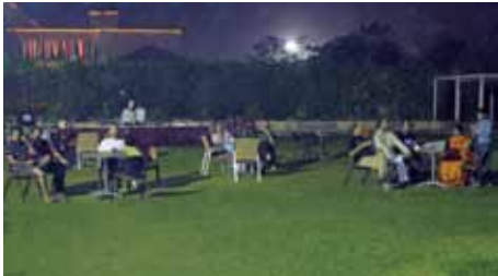
Enjoying the fireworks display in the lawns of Gardenia

To bring in Diwali with a bang, a 'Fire & Cracker' show took place on October 25 in the lush greens of Gardenia. A great way to enjoy Diwali festivities amongst friends!