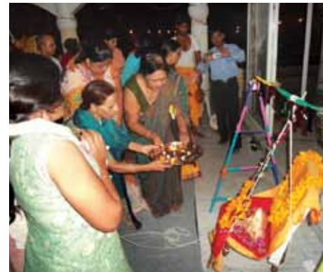
Janamashtami Celebrations at Utsav

Janamashtami celebrations at Utsav began with puja and continued with bhajans, group dances and recitation of the Krishna Katha.