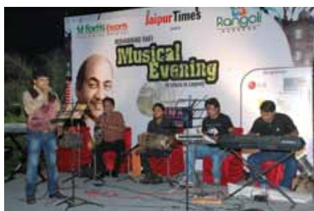
The Medical Fraternity pays a tribute to a Singing Legend

Rangoli Gardens was one of the co-sponsors of the Doctors' Meet, which paid a tribute to Singing Legend Mohd. Rafi, at Maharani Farm, Mansarovar in July. Over 100 Doctors and their families enjoyed the event.