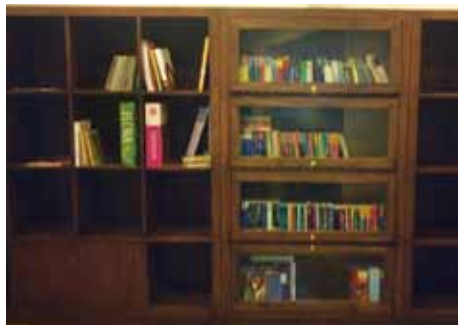
The latest attraction at Aangan is the neatly arranged Library