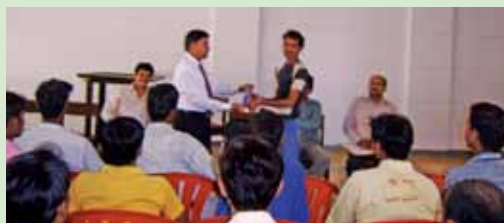
Plumbers learning how to take advantage of the latest technology

Plumbers working at the Aangan site underwent a training session by Astral, to learn advanced methods and use of new tools to improve all aspects of Plumbing.