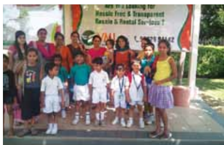
The aesthetic bus stand at Ashiana Aangan provides shade to students and their parents