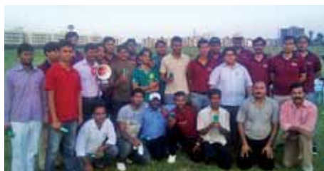
The victorious VML Team