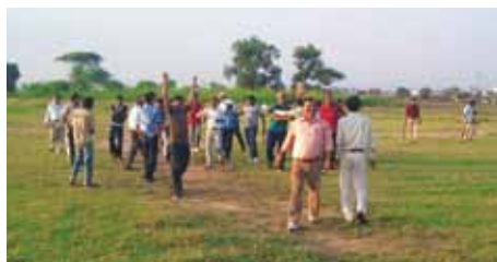
A friendly cricket match was organized by VML after the Vishwakarma pooja