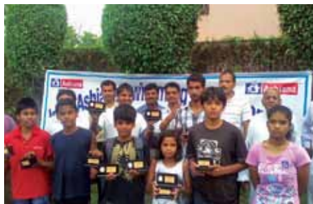
Inter-Ashiana Swimming Competition Winners and Runners-up with the Coordinators

Ashiana Gulmohar Park was the venue for the eagerly awaited Inter-Ashiana Swimming Competition. Residents from Aangan, Gulmohar Park, Gardens and the Village Projects took part in it.