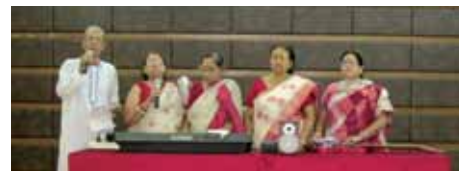
Dewanjee and Group regaled the residents at the Independence Day celebrations at Utsav