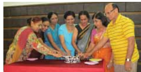
The cake cutting ceremony !