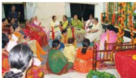
The Utsav Temple wore a festive look on Janamashtami, and our Utsavites celebrated the event with Bhajans, Aarti and Prasad