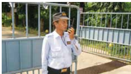
The Security Supervisor at Ashiana Gardens communicating with the Maintenance Office on his new Walky Talky

VML, in its pursuit of better and efficient services and security, has provided its staff with Walky-Talkies at Ashiana Gardens.