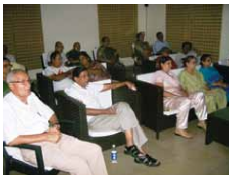
The convenience of a movie hall next door

Residents had a relaxing time watching Zindagi Na Milegi Dobra at the Activity Centre, which was followed by delicious snacks served by the Utsav Cafe.