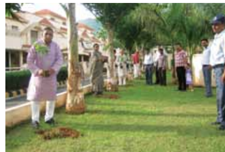
Residents of Ashiana Woodlands at the Tree Plantation Drive